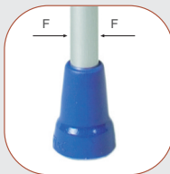
ref. no. 118...