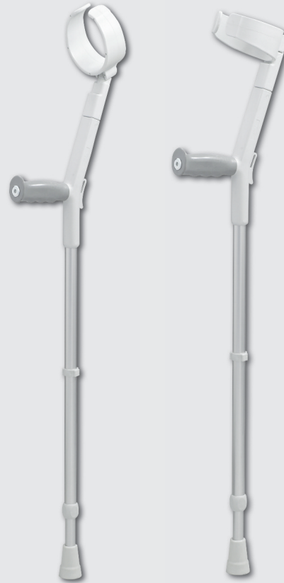
ref. no. 117...